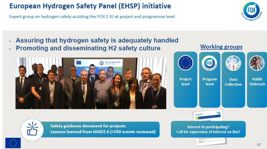
Figure 3. EHSP kick-off meeting of first trimester 2018.

The EHSP is composed of a multidisciplinary pool of 16 experts, grouped in small ad-hoc working groups (task forces). Collectively, the members of the EHSP have the necessary scientific competencies and expertise covering the technical domain of hydrogen safety to provide science-based recommendations to the FCH 2 JU.