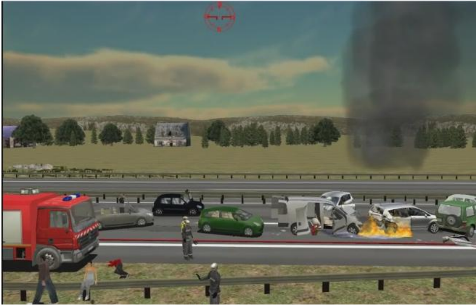
Figure 2. A screenshot of the VR exercise involving multiple cars crash on a motorway

Two scenarios were considered during the workshop: 1. A multiple car crash on a motorway involving a FC vehicle (Symbian equipped Kangoo) and 2. An overturned trailer currying liquefied hydrogen positioned near the shopping mall. The conditions and environments of both scenarios are shown on Figures 2 and 3.