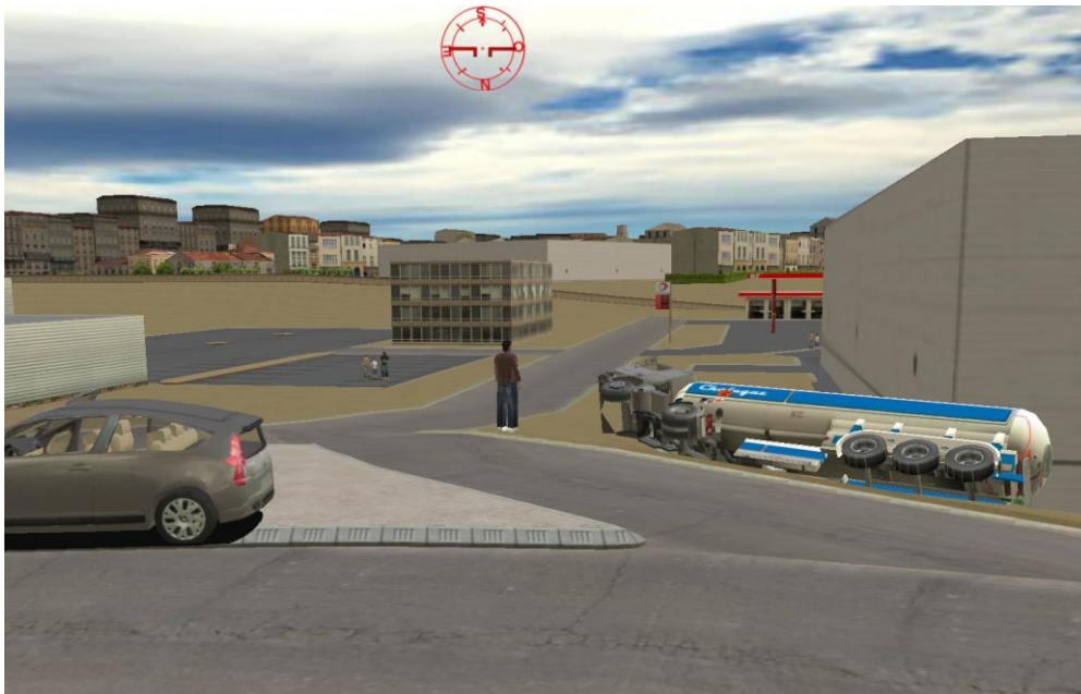
Figure 3. A screenshot of the VR exercise involving the overturned trailer with liquefied hydrogen