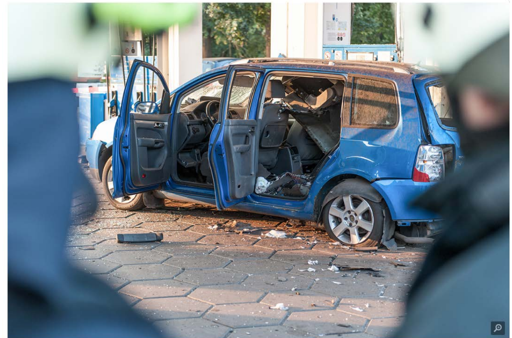
Bild 2 von 7 Der Fahrzeugführer stand vor seinem Auto. Er wurde von Trümmerteilen verletzt

58 years old driver seriously injured; ARAL and other fuel suppliers stopped CNG fueling of all VW CNG cars. Claims: „driver was informed before, not to fuel with CNG“; „there was no explosion“