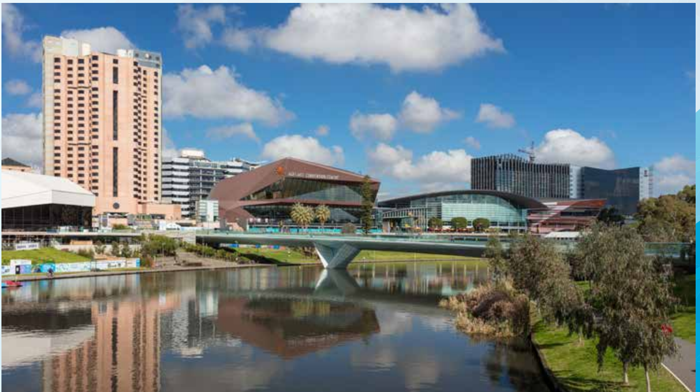
ICHS 2019 will be held at the Adelaide Convention Centre.

A website devoted to the conference is now live, and will be updated continuously in the lead up to the event providing all the most up to date information on the program, speakers, social events and a section dedicated to sponsors: www.ichs2019.com